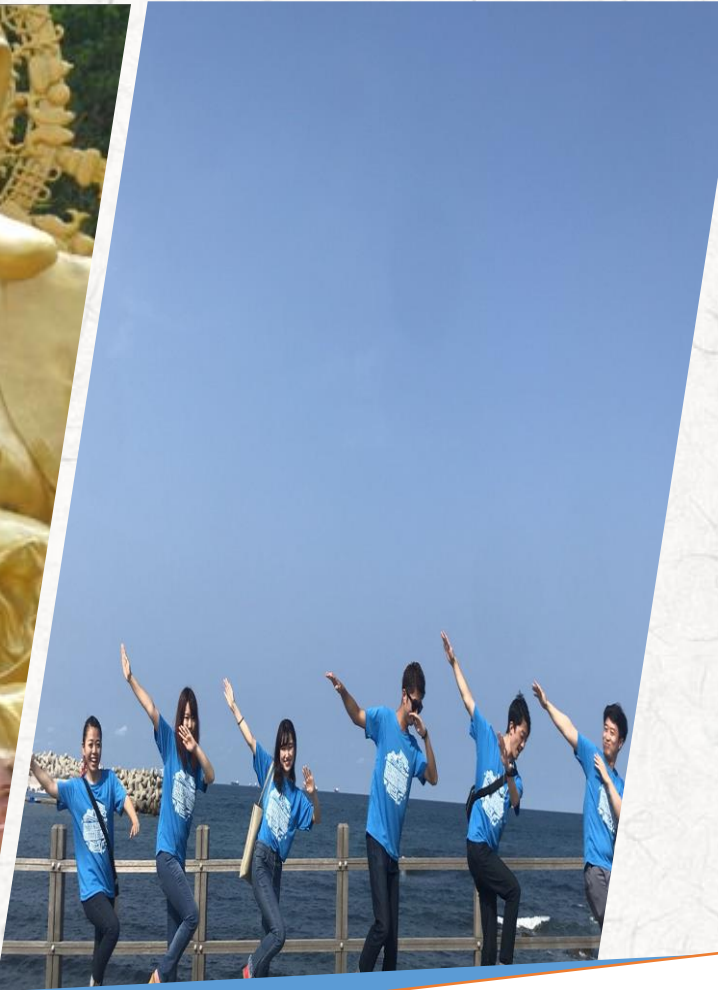
City Tour Group Activities