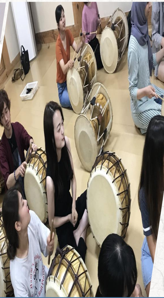
Korean Traditional Culture Activities