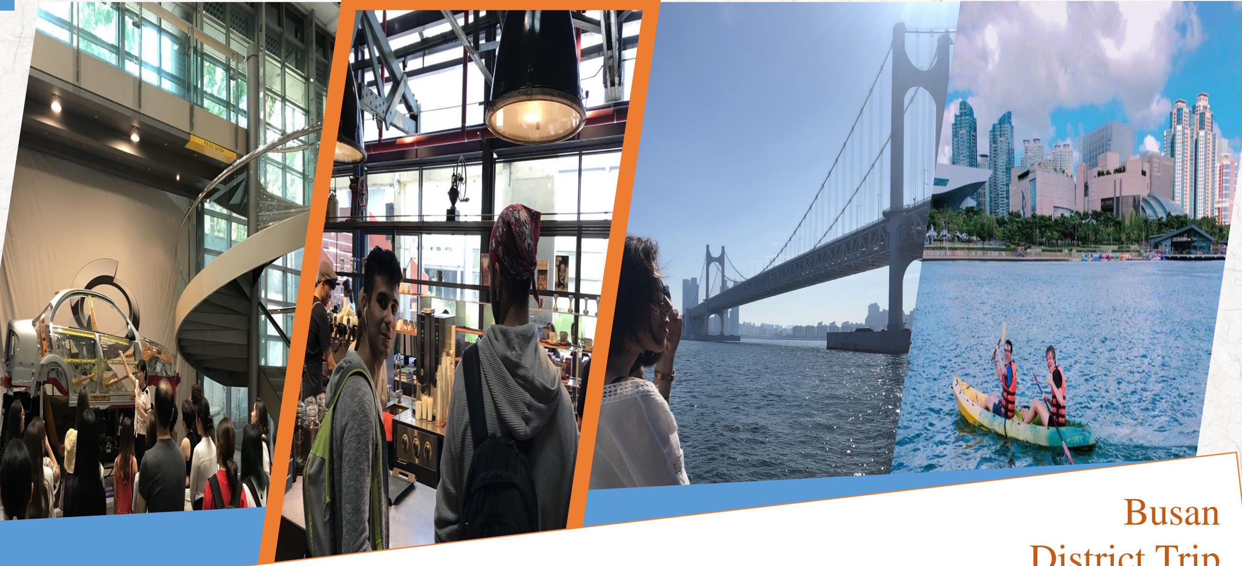
Busan District Trip